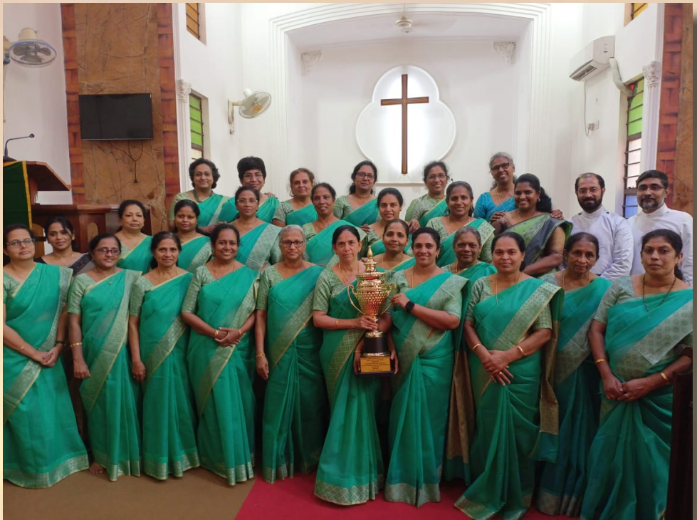
Our WF bagged first price for quiz competition during combined retreat held at our church